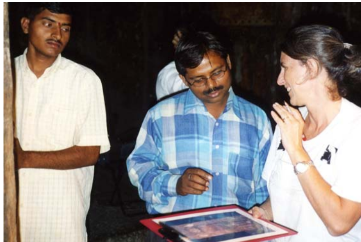
Fig. 3 - Cave 17, Ajanta, Maharashtra, India

The data presented is therefore provisional, with symbolic colours on acetate sheets placed over orthophotos, taken for this purpose by the photographer Edoardo Loliva, and on copies of line drawings done by Monika Zin and Matthias Helmdach and published in 1999 in the “Guide to the Ajanta paintings” available at the site. With this system, observations and recordings have been made together with the local experts who will now proceed to extend and complete the work already set in motion (fig. 3).