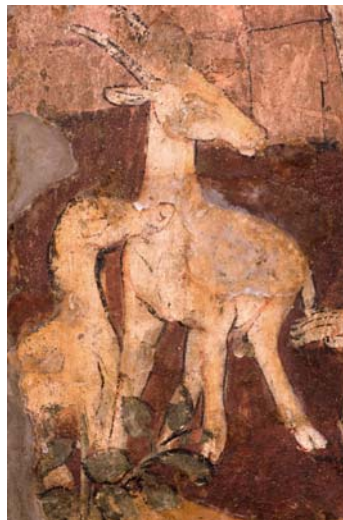
Fig. 6 - Cave 17, Ajanta, Maharashtra, India - reintegrated fills

On the fills carried out with the mortar described in point 1, and perhaps on that indicated in point 4, chromatic surface treatments with covering or glazed colours are present at times. The treatment generally aims to reduce the disturbance in the reading of the pictorial text with a uniform application over the entire surface, although in some cases it may be considered in every respect a chromatic integration in tone (Fig. 6).