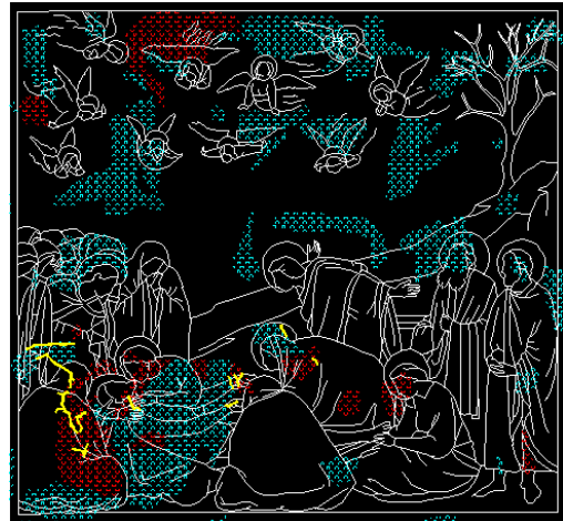
Fig. 5 - The Scrovegni Chapel, Padua