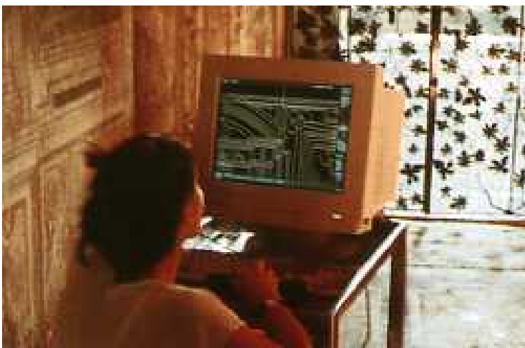
Fig. 1 - S. Cecilia in Trastevere, Rome

During the organizational stage of the work, the original plan was to carry out a laser scanner survey of the whole of Cave 17 to be used as a graphic base for the theme-related mapping so as to be able to insert the data directly onto the PC in situ, eliminating the risk of transcription errors. Computerized graphic documentation systems in this organizational form have actually been in use for some time at ICR and we have included some examples of work sites for mural paintings by Paul Brill and Antonio Circignani in the Cappella del Bagno and ambulatory of the Church of S. Cecilia in Trastevere (Fig.1) as well as that of the Giotto paintings in the Scrovegni Chapel in Padua (Fig. 2) in which the author of this paper actively participated in the planning and execution of the work of documentation and restoration [1] .