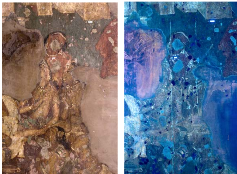
Fig. 5 Cave 17, Ajanta, Maharashtra, India Visible and UV light.

Among the data recorded through conservation data recording and theme-related mapping, one can still cite the example of cataloguing the fills of the lacunae. Correlating the data emerging from UV observation (Fig. 5), different types of mixture and different surface treatment solutions were actually observed and recorded, which indicates the succession of restoration treatments during which different principles of integration were applied.