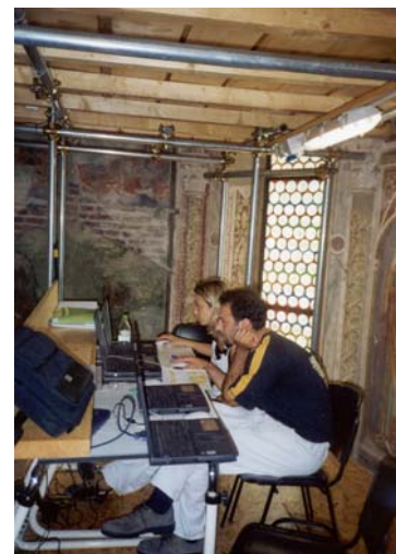
Fig. 2 - The Scrovegni Chapel, Padua

The survey was actually carried out [2], but the lack of continuity in the supply of electricity in the archaeological area, made it very difficult to the use a portable computer the whole day long. The limited lighting and the nature of the wood structures made available to reach the higher areas of decoration necessitated, moreover, using easy and manageable recording instruments like pen and paper.