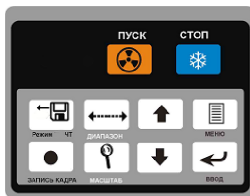
Fig. 4. Keyboard overview

The “Menu” key calls on the display the menu of video processor (see table 1). The key «Input» confirms selection of required option.