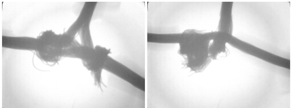
Fig. 7. Detection of wire connection rupture in all-in-one contact assembly (the images are obtained in case of projecting amplification)