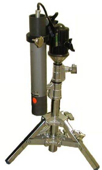
Fig .2. X-ray apparatus RAP -70 with tripod

The X-ray generator is placed in metal cylindrical housing. In it is located the high voltage transformer for power supply and X-ray tube with cooling system. To suppress the radiation outside the working beam there is lead