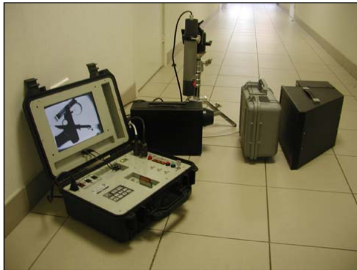
Fig..1. Mobile X-ray TV complex “Ochertanie-TV”

X-ray apparatus RAP -70 (Fig. 2) is designed to be used in the set of mobile X-ray TV system like a source of stabilized X-ray radiation with regulated anode voltage and current of X-ray tube. It has protection from: overheat of the high-voltage block, from excess of a current and voltage in the tube; from break of a circuit with switching-off of a power supply with indication of the reason of switching-off on the external control and visualization unit. The apparatus can be operated from various voltages (30 kV, 50 kV, 70 kV) without necessity to switch on high voltage as such switch on is performed from external control and visualization unit.