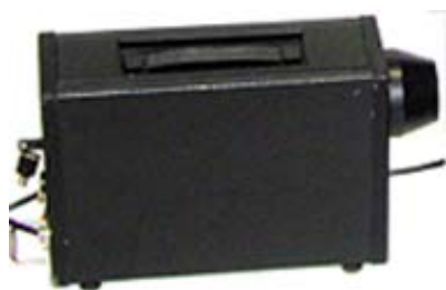
Fig. 3. X-ray apparatus RAP-100

The video processor has a number of optional functions that control the selection of operating mode, for instance, type of image registration, image presentation and processing, recording and output. Also processor generates command to switch the X-ray radiation after the image is recorded.