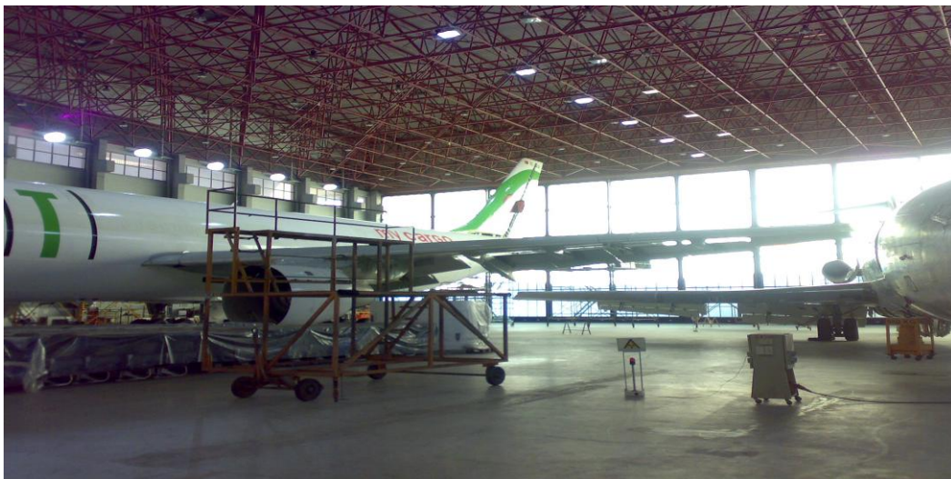
Figure 1. Maintenance Hangar

Aerospace NDT Training is situated in the maintenance hangar and classroom on the Airports.