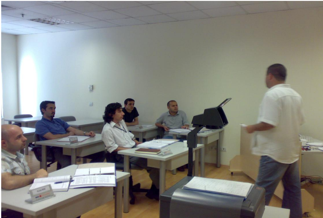
Figure 2. Theoretical Part of Training