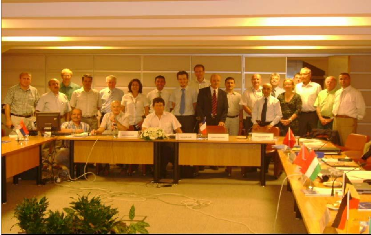
Figure 6. Second EF ANDTB Forum in İstanbul