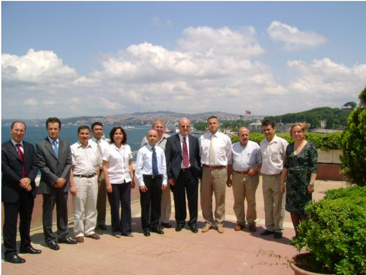
Figure 4. Turkish National Aerospace Nondestructive Testing Board

Turkish National Aerospace Board is chartered by aerospace maintenance organizations, airlines and training organizations. Turkish national aerospace board is recognised by the Turkish Civil Aviation Authority ( SHGM ) to provide or support NDT qualification and examination services in accordance with TS EN 4179.