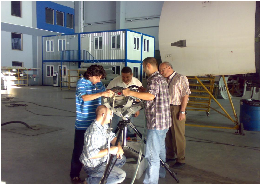
Figure 3. Practical Part of Training