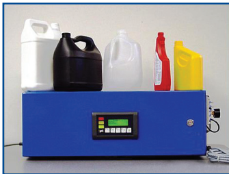
VeriCon 126 Trimmer

Heinz Wolf, general manager, commented, “With over 25 years experience, PTI offers reliable, industry proven technology with over 1,500 inspection systems installed to-date. VeriCon leak testers are established worldwide, assuring container integrity in a variety of industries and applications.”